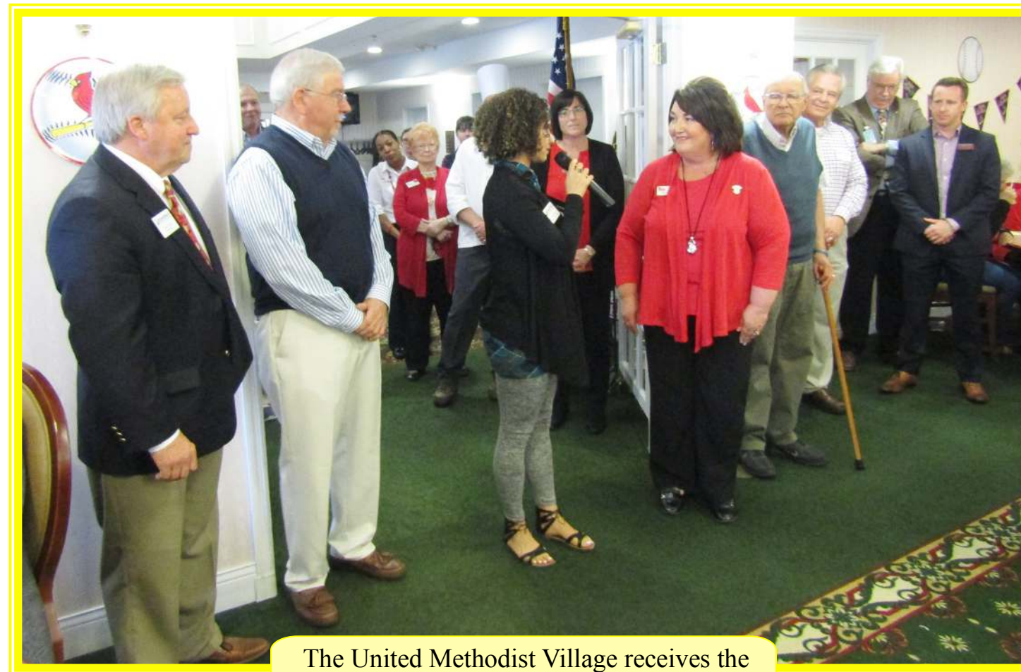
The United Methodist Village receives the Riverbend Growth Association Small Business of the Month Award for April 2018 Another reason to be proud of your Senior Living Community!

The Resident Council had a meeting on Wednesday, March 14. The minutes are available on the Information Center Bulletin Boards. The next regular Resident Council meeting is set for May 9 at 1:00 pm in the Conference Room.