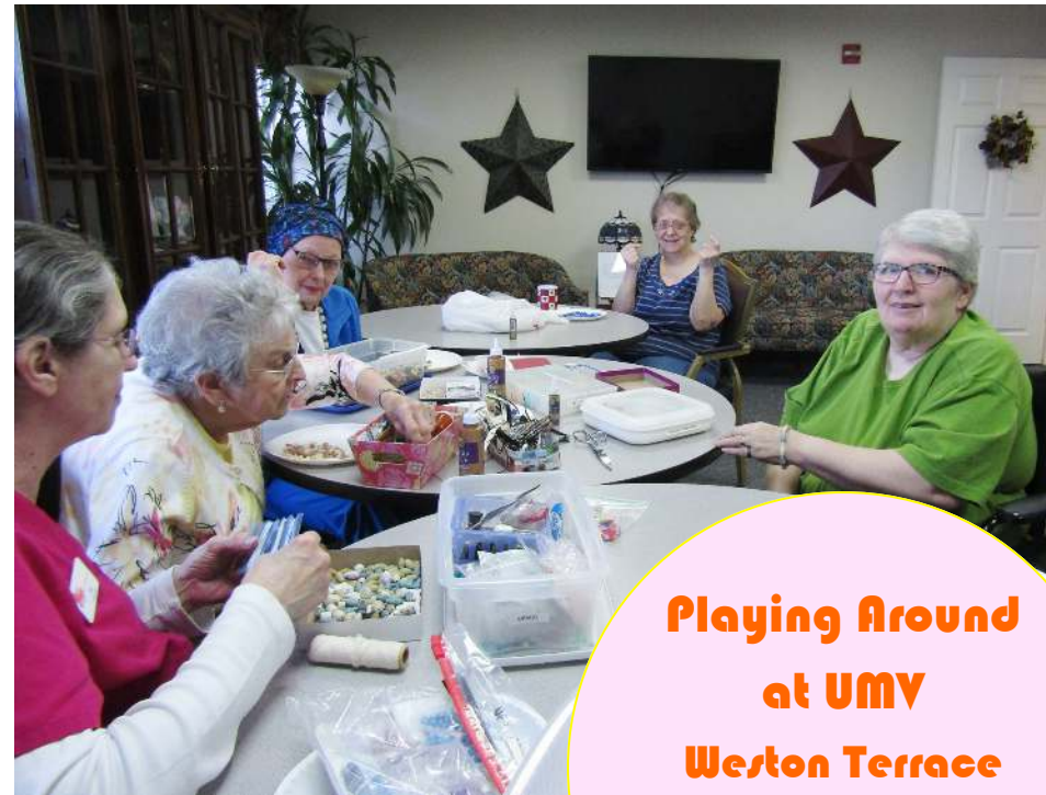
Playing Around at UMY