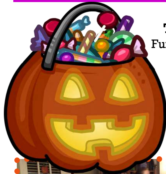
Trick-or-Treat! Fun and friendly faces came to visit for Halloween.