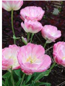
UMV tulips