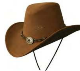
FATHER'S DAY LUNCHEON WITH HILL-WILLIAMS