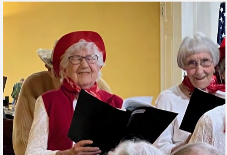
Asbury Village Choir