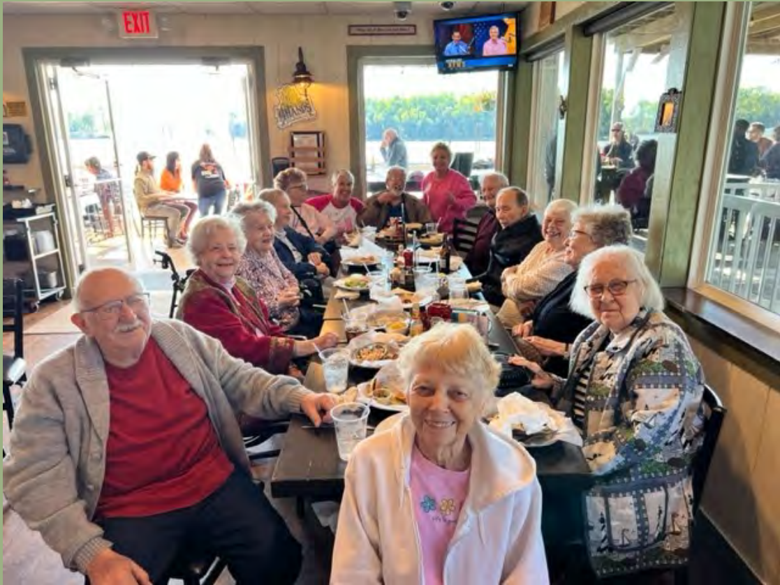
Lunch Out at The Oyster Bar